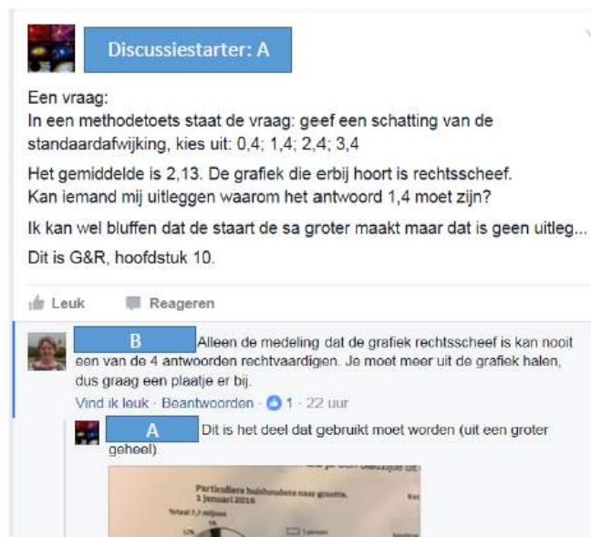
Figure 2. Copy of a dialog on the Dutch mathematics teachers' Facebook Group